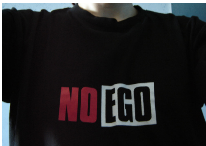
No Ego Project, 2005

Born in Dubrovnik (1975). Lives in Dubrovnik and Zagreb.