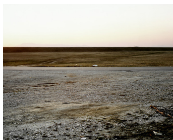
Untitled, #1, 2008

Ana Hušman's interest lies in the social norms and rules that shape our daily lives. She explores how these rules are formed and the models from which they are established. Her work lies at the boundary between cinematic image and video image, digital photographic recording, the relationship between time and frame, the process of film production and the framework for its deconstruction.