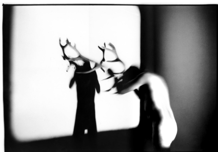
Nature & Society, performance, 2002